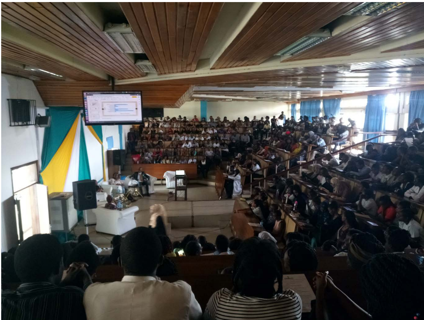
Students at the symposium

wards. Students lose their self-esteem in the process. Some have increased anxiety during exams and this may lead to poor performance. All discussions concurred that lecturers accused of TBH to be reported to the administration. However, the students were advised to pick the positives out of all situations as this will improve their coping mechanisms when they later graduate as doctors.