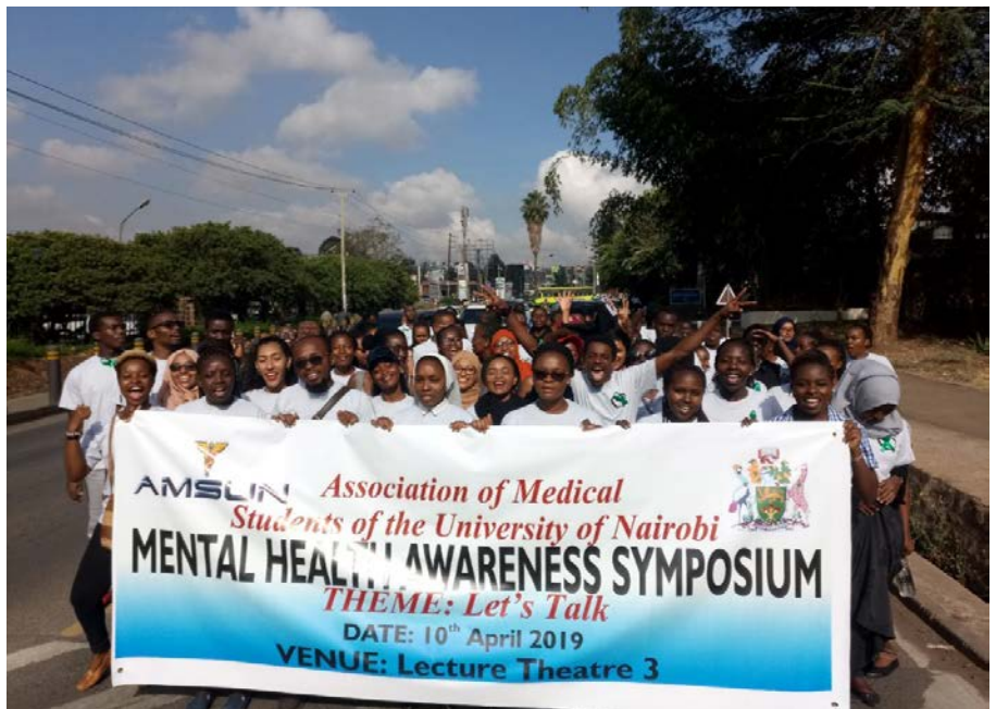
AMSUN members in the walk to sensitize the public

One of the panelists, a student, shared actual case studies of the suicide attempts among medical students and their causes. Exam failure, substance abuse, and failed social relationships were ranked top in causing suicidal ideations/attempts among medical students. To counter this issues, communication was identified as essential in early identification of students who are at risk of attempting suicide. Increasingly, seeking help through the university clinic can also help reduce suicidal cases.