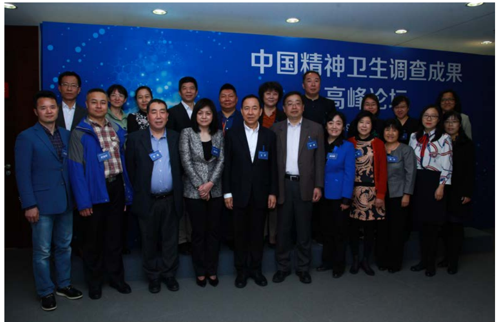
Forum of CMHS in Beijing

The result of CMHS was released by the National Health and Family Planning Committee (Ministry of Health) of China on the World Health Day, April 7, 2017. Afterwards, the Forum on Mental Health in China was held on April 19, 2019 in Beijing.